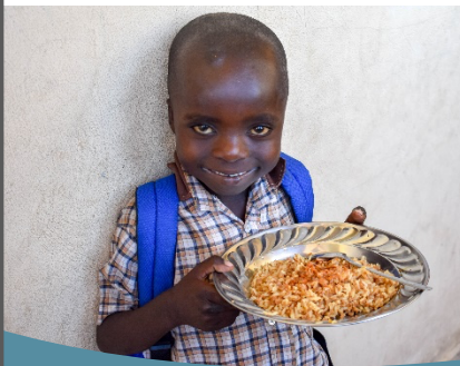
Students are so grateful for the nutritious meal they receive at lunchtime!

* Donor is matching each donation for these projects.