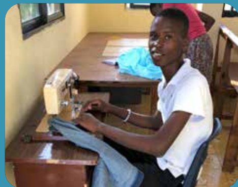
Teens sew clothing and masks

teens participated in training programs to equip them with skills for independent living