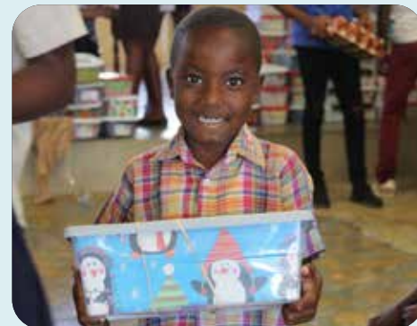
Christmas Joy Box shares hope