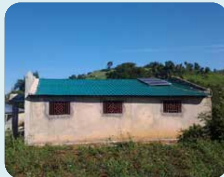
New roof at Robert school