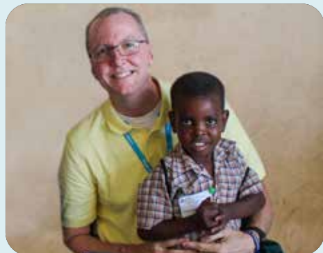
Sponsors make a difference