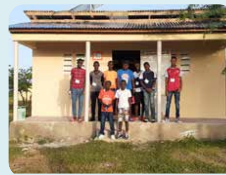
New cabin for campers