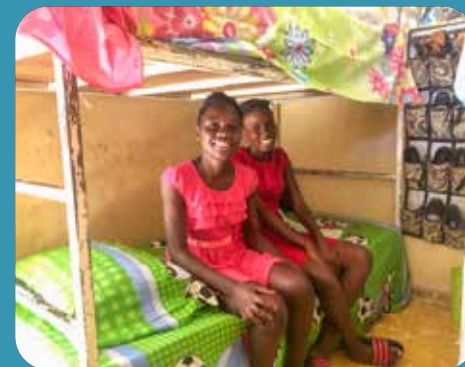
Girls thrilled with new bedding

children received new mattresses, bed sheets, and curtains in their room