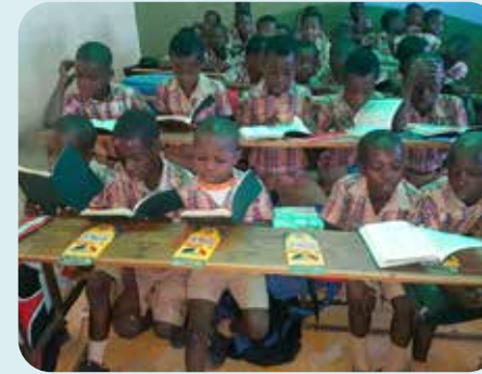
Students studying the Bible