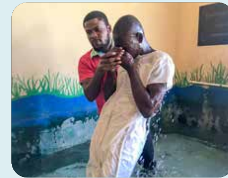
72 baptisms at Camp Hope