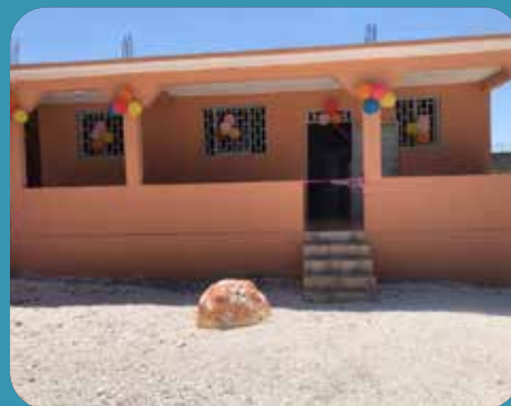
New home for house parents

new home built for the house parents at the Thomazeau Orphanage