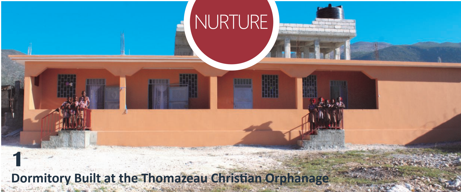
1 Dormitory Built at the Thomazeau Christian Orphanage