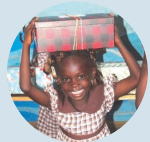
2,658 Christmas Joy Boxes Delivered packed by 24 Church groups