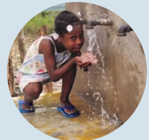
335,000 Gallons of Water to Thomazeau Community