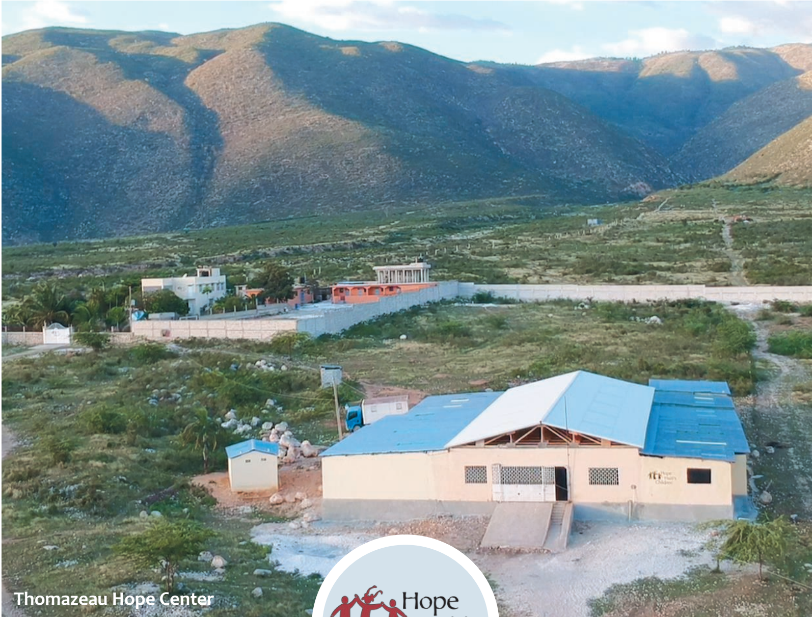
Thomazeau Hope Center