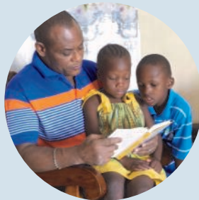
84 Orphaned Children Loved