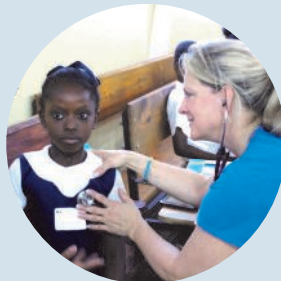
1,736 Children Served at Annual Child Care Clinic