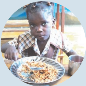
1,124 Children Received Hot Meals at School