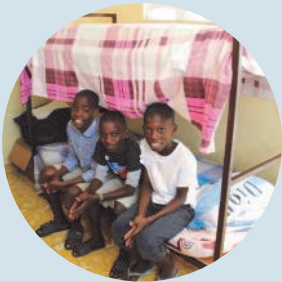
2 Christian Orphanages