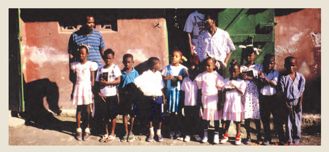
First children enrolled in HFHC's child sponsorship ministry

We praise God for how he has continued to bless this ministry bringing the necessary partners and resources to allow us to now sponsor 1,378 children in 10 Christian schools, support 84 children in two orphanages, and operate a Hope Center outreach facility. We look forward to the next 20 years!