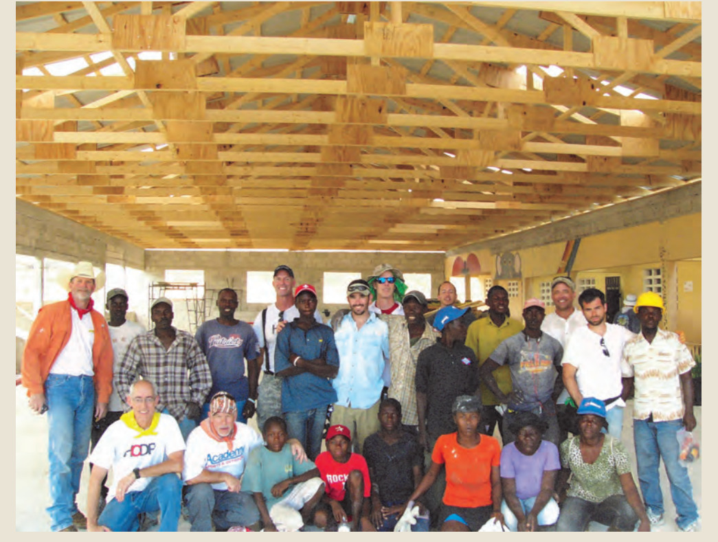
Houston-Haitian joint team which assembled and raised the pavilion in 5 days!

We praise God for His help in bringing all the resources required together and thank everyone who played a part in turning this dream into a reality.