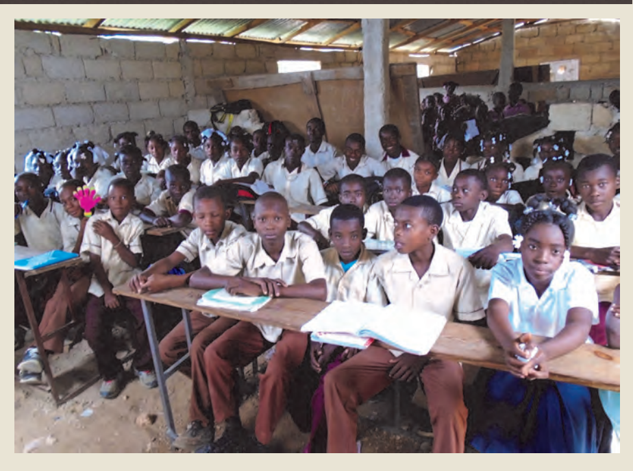
Students sit in their crowded classroom

HFHC's School Uplift! ministry brings focus to the needs of our partner schools so that the environment is as conducive as possible for learning. The children in the 5th grade classroom (pictured right) located in the mountain village of Robert sit shoulder to shoulder in this crowded classroom with a dirt floor. A concrete floor ($3,000) is currently on the top of the capital needs of this school. All of our schools need desk benches ($125/ea) and chalkboards ($200/ea). Larger capital projects include building a kindergarten classroom at the Pageste Christian School ($10,000) and replacing a worn metal roof at the