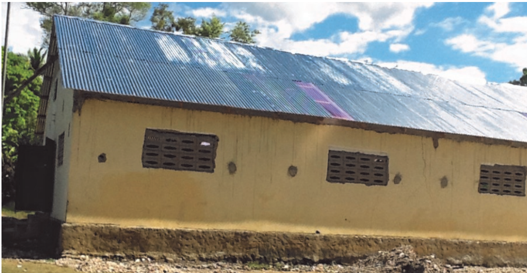
New School Roof with Skylights