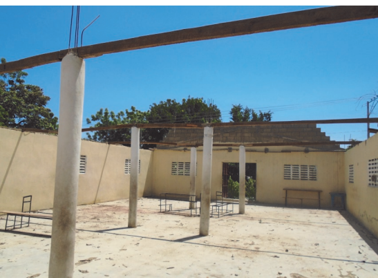
Storm blows away roof on the Dubuisson Church of Christ and School

With church members helping with much of the labor, the new roof was completed on September 11, with a celebration gospel meeting in the facility on September 13 and the school opening on September 14. What an a incredible team effort!