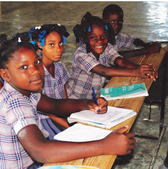
Students very thankful to start school with a new roof and new school benches