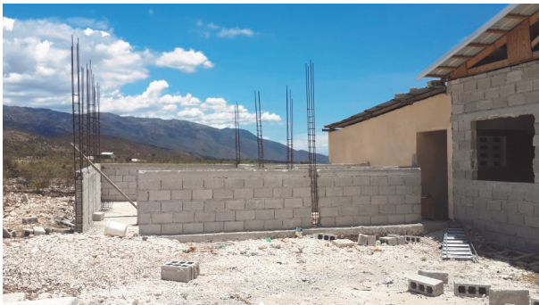
Thomazeau Hope Center Kitchen to Feed Malnourished Children Under Construction