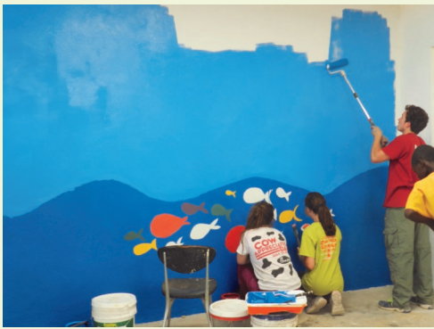
Pictured left: Team from the Bellevue Church of Christ paints kid-friendly murals in school classrooms