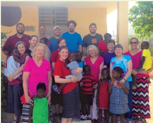
The Edmond Church of Christ team with the orphans at Thomazeau.