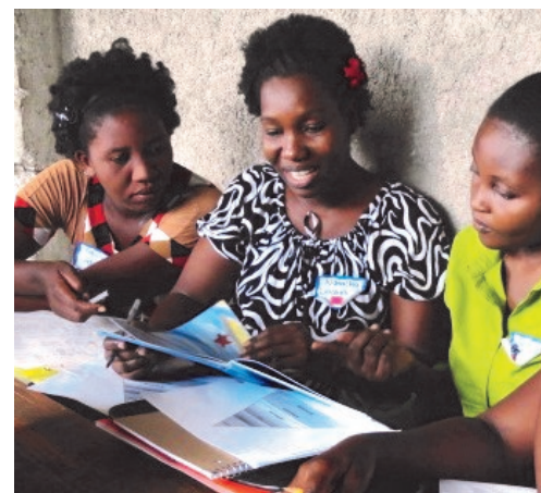
Haitian Educators Practice Bloom's Taxonomy

Over the last two years, the U.S team has been amazed at the openness and enthusiasm of our Haitian teachers. After the first year's training, principals informed the trainers that the entire environment of their school had changed — teachers returned to school excited to teach and children learned material faster than ever. We applaud these Haitian teachers and their ongoing effort to become the best teachers possible!