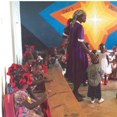
School began in September and all 10 schools were provided with additional new school benches (desks)