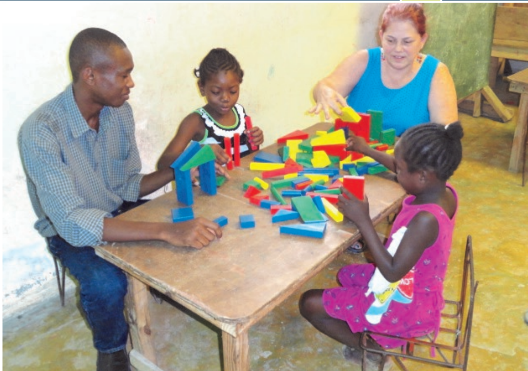
Our Thomazeau Pilot Program Where Educators Are Learning the Importance of Hands-on Learning

teacher, one teacher stood before his peers and challenged them to heed the words of the trainer. This man grieved over the fact that there was a gap in his own education, one that prevented him from understanding how children learn. In the past he felt it was the student's role to learn; his role was simply to impart knowledge. He had not taken into consideration how the students in his class learned. With new knowledge in hand, he left hopeful for his future.