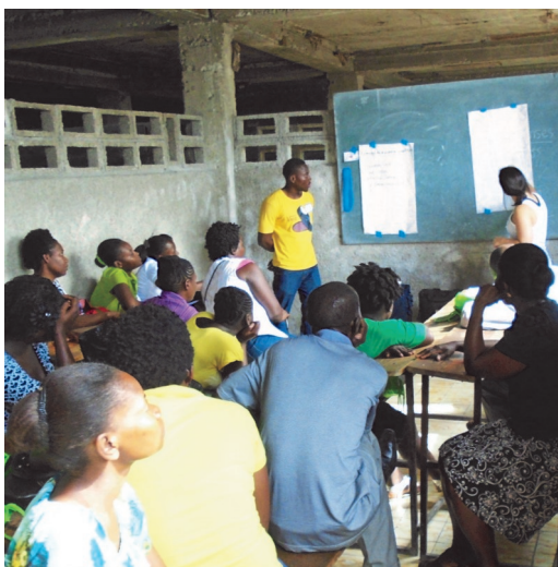
74 teachers attend 2 nd Annual HFHC Teacher Training Conference

After a session on learning styles (auditory, visual and kinesthetic) and how to become a more effective