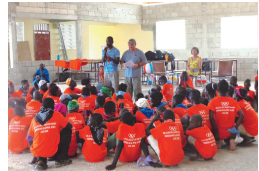
Summer "Youth Day" at newly completed Thomazeau Hope Center pavilion organized by First Colony mission team