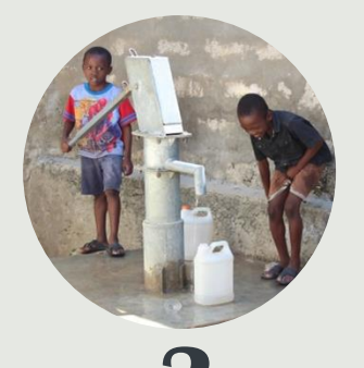
School Wells Dug