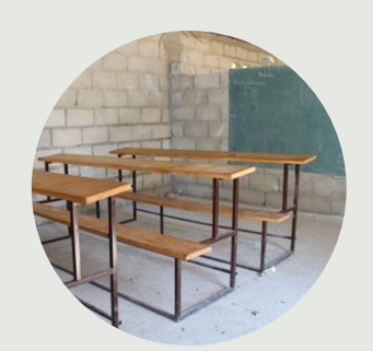
75 New School Benches