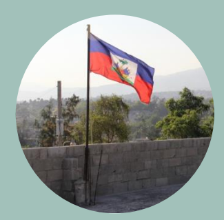
10 Christian Schools