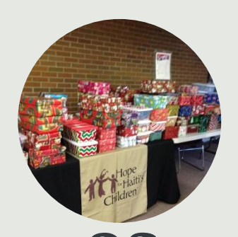
23 Churches packed Christmas Joy Boxes