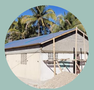
New School Roofs