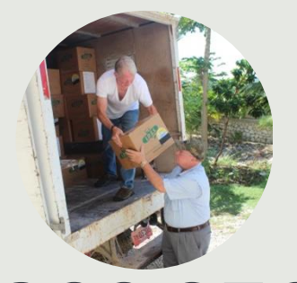
266,976 High-Protein Meal Packets Delivered