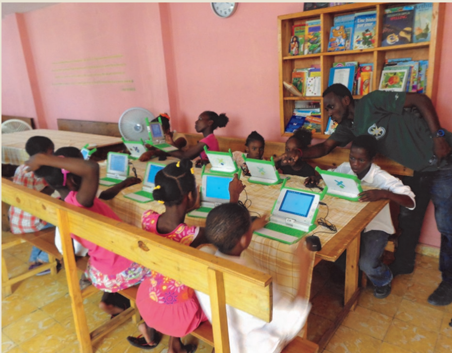
Geography, History and even Math can be fun to learn on a laptop!

the success of this effort -- funding the supporting technology at Cazeau, including an "Internet in a Box" server. This server is now loaded with Wikipedia and a vast number of digital books - more books even than the Haitian National Library!