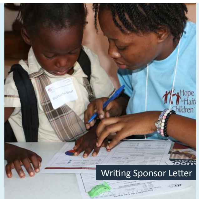
Writing Sponsor Letter