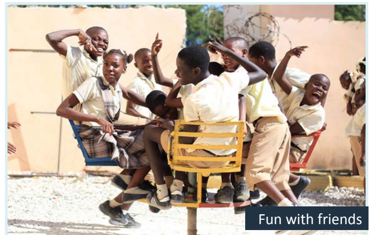
Fun with friends