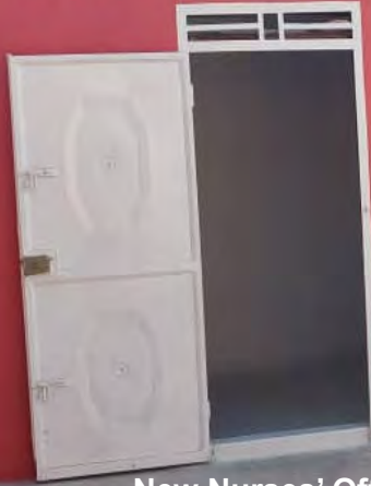
New Nurses' Office at the Cite Soleil Christian School