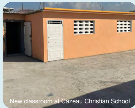
New classroom at Cazeau Christian School

overall pass rate on 9th grade national exam