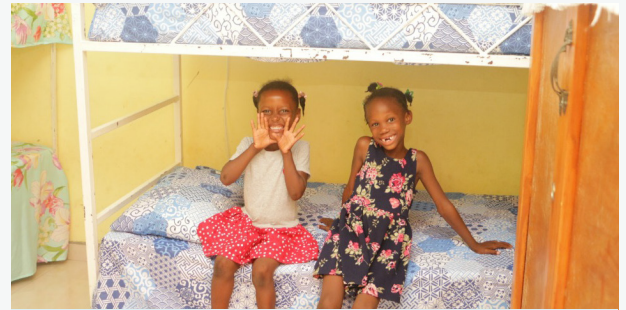
Children can rest with comfort and joy — new mattresses, sheets, and pillows provide a safe place to sleep