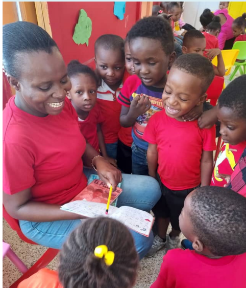
Children enjoying every minute of story time at VBS.

Thankfully, students’ spiritual formation does not end when camp concludes! HFHC schools provide a consistent foundation of faith through a structured Bible curriculum. Throughout the 2024–25 school year, students studied a survey of the New Testament. In 2025–26, the focus will shift to the Old Testament, and in 2026–27, lessons will center on the Life of Christ. continue on page 2