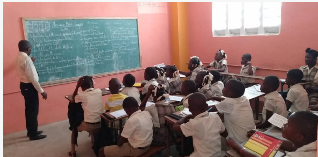
In the classroom — a Bible teacher equips students with truth that lasts forever

At the heart of Project Hope is our desire for every child to know their eternal worth in Christ. Through Bible classes, leadership training at Camp Hope, and mentorship from church leaders, children are being equipped to grow in faith and hope.