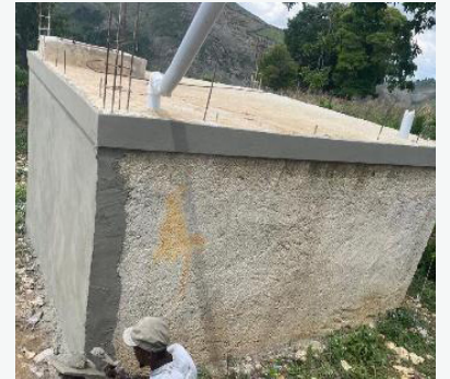
Rainwater from the school roof now fills this cistern — bringing safe water to the remote mountaintop village in Robert