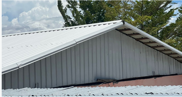
From leaks to lasting shelter — this roof at Thomazeau was repaired

A quality education opens doors for a child's future. Project Hope is committed to providing safe schools, strong teachers, and the tools children need to succeed. Recent investments have repaired roofs, built new classrooms, purchased new desks for students and teachers, and provided teacher training.