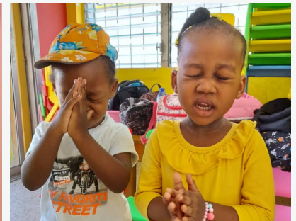
Teaching the youngest to seek God in prayer

Together, we can transform possibility into lasting impact.