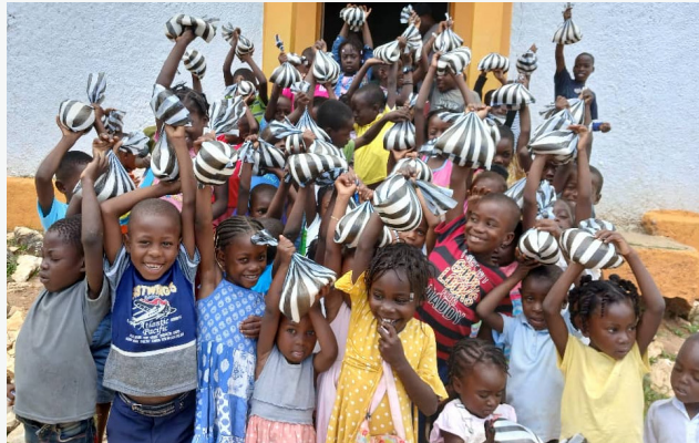
Joy overflowing — children proudly carrying food to take home to share with their families

Hunger and thirst don't take a break when school is out. This summer, children and their families received food to sustain them until classes begin again — a reminder that they are cared for even outside the classroom. At the same time, wells and water systems were repaired and expanded, bringing safe drinking water to more communities.