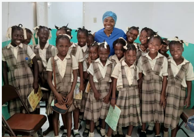
A caring nurse at the Thomazeau Christian School, keeping students healthy and thriving

Wellness today builds hope for tomorrow. We are working to ensure each child has access to a school nurse, medicine, and preventative care. This summer, two new nurses' offices have been built, children have received dental checkups, and medicines have been distributed to clinics. Your generosity helps cover salaries for nurses and provides essential care so children thrive in both body and spirit.