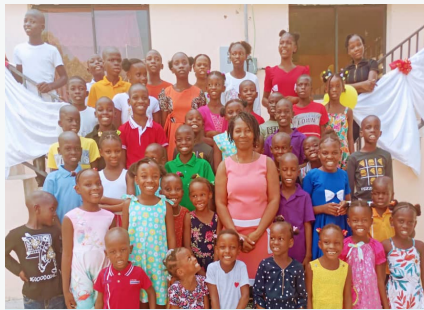
Surrounded by love and care — children growing up at the Cazeau Orphanage with dignity and hope for the future

For children without families, Project Hope provides a safe home filled with love, dignity, and opportunity. This year, orphanages were strengthened with new mattresses for restful sleep, repaired flooring, and vocational training supplies to help prepare children for the future.