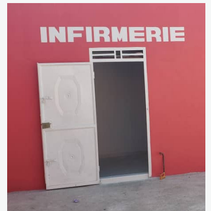
A new nurse's office at our Cite Soleil school provides a private space for comfort and care when students aren't feeling well