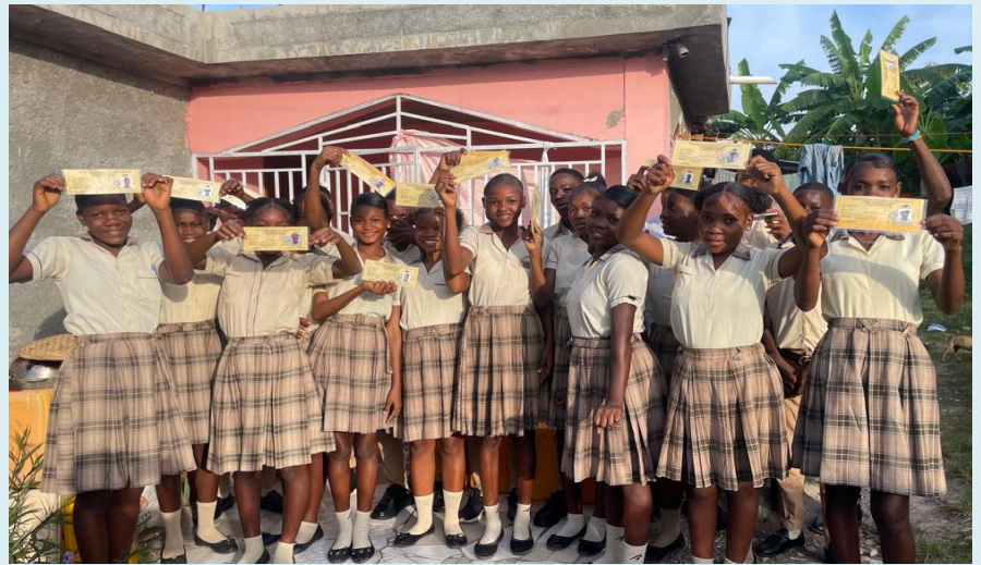
Hope for Haiti's Children Compared to National Average