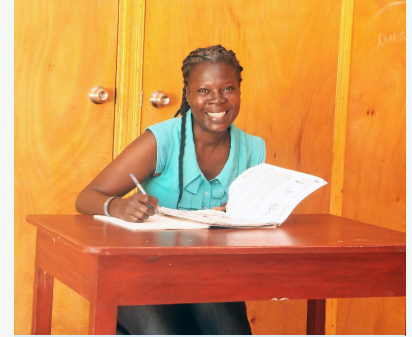
Every teacher now has a desk!