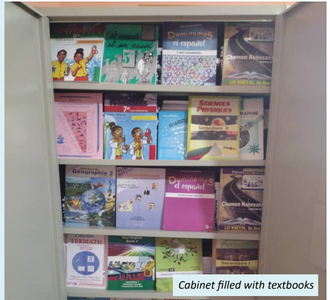
Cabinet filled with textbooks