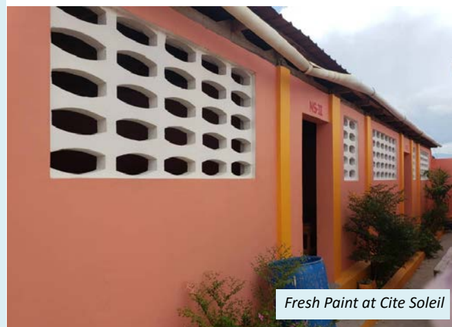
Fresh Paint at Cite Soleil