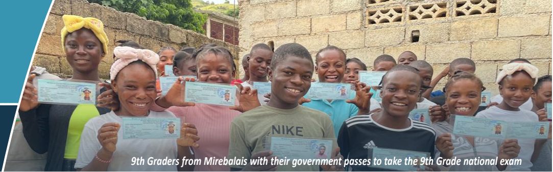
9th Graders from Mirebalais with their government passes to take the 9th Grade national exam