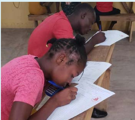
Students at the Thomazeau Christian School taking the exam - 100% of the students passed!