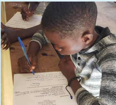
All students in the 9th Grade took their National Exams from July 22nd-24th

We are so grateful for our HFHC child education sponsors cover these essential costs, providing students with the opportunity to receive an education and become future leaders of Haiti. The students recognize that education is a privilege, and they are immensely grateful for your support. Thanks to your generosity, these 9th graders have passed their national exams and are now advancing to 10th grade. They carry the hope of realizing their dreams and contributing to a brighter future for Haiti.