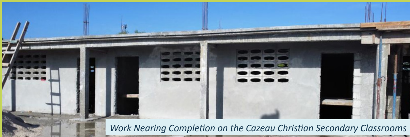
Work Nearing Completion on the Cazeau Christian Secondary Classrooms