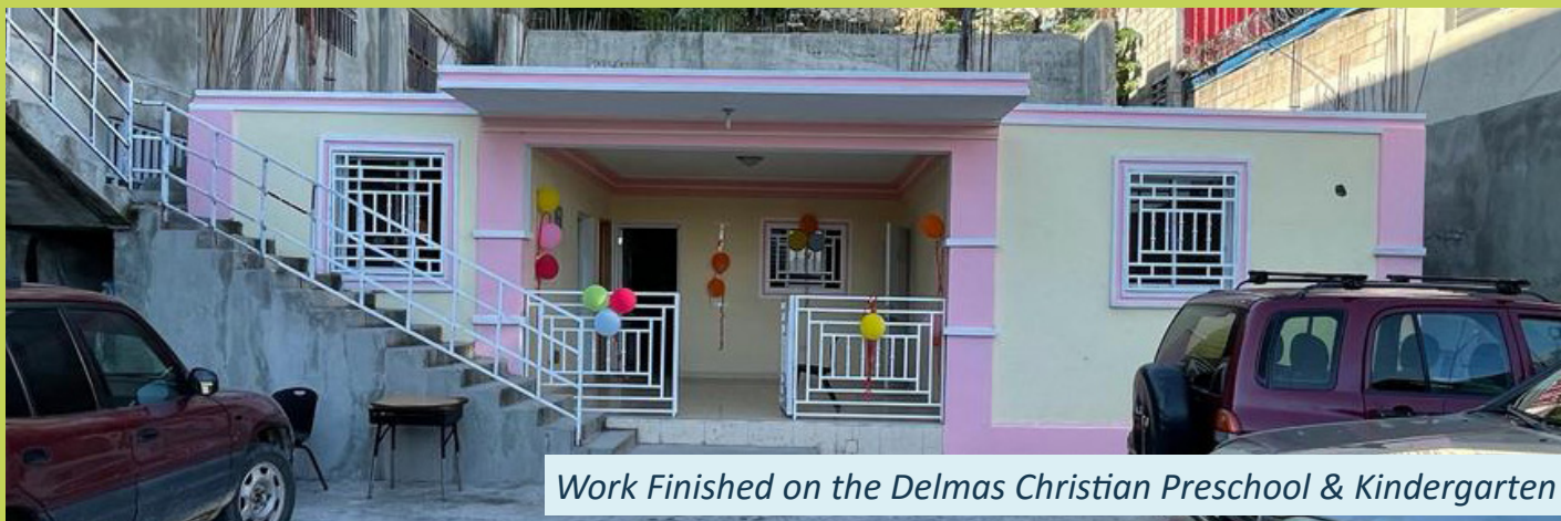
Work Finished on the Delmas Christian Preschool & Kindergarten

Thanks to the generosity of our Project Hope donors, more school construction projects are underway now than in the history of HFHC! Our Haiti construction teams have continued to persevere despite security challenges, employing many local parents of HFHC sponsored children which provide vital income for their families. Shown below are recent photos from three of these important projects.