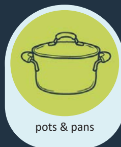
pots & pans