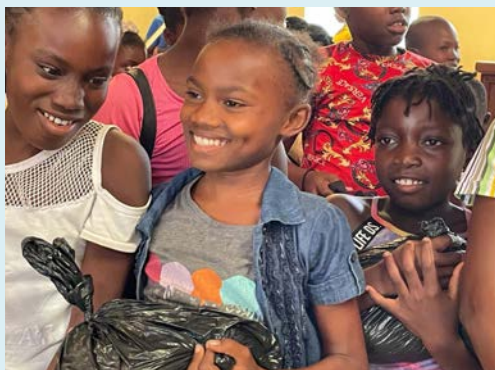
All smiles taking home rice & beans