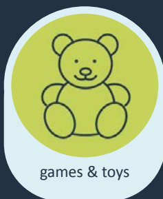
games & toys