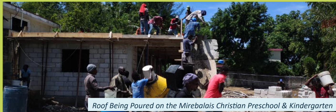
Roof Being Poured on the Mirebalais Christian Preschool & Kindergarten