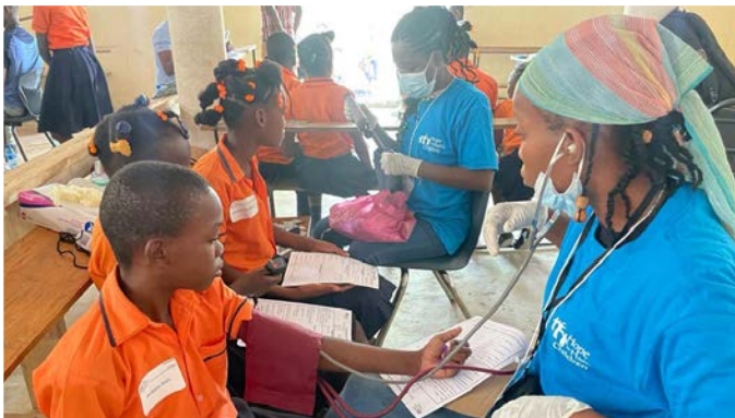
Nurses check each child's vital signs and keep records of any medical problems or concerns.

Despite the ongoing danger and chaos throughout Haiti, our amazing staff continues to host medical clinics for more than 2,400 students and community members.