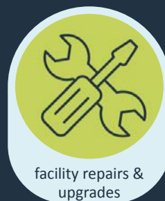
facility repairs & upgrades

We need your help to care for the children in our orphan care program!