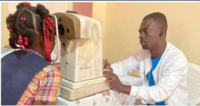
Children with vision problems visit the optometrist.