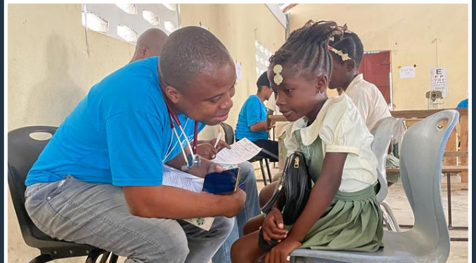
A visit to the doctor includes a thorough well-child check.