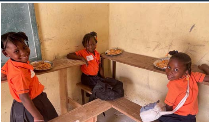
Children receive hot lunches on-site after their medical checkups and often eat with their friends and classmates.