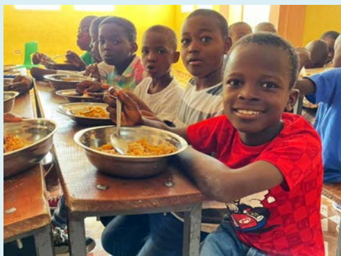
Children enjoy a hot meal during VBS this summer