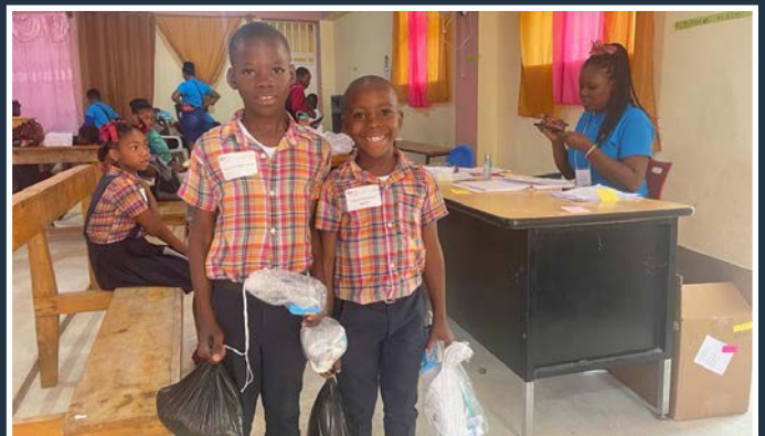
When they've made the rounds to each clinic station, students receive bags of rice and beans to take home to their families.