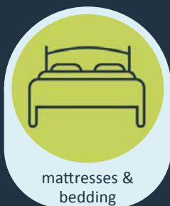
mattresses & bedding