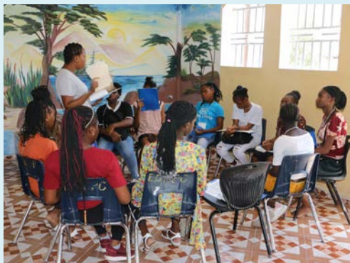
Teen girls participate in a small group Bible study