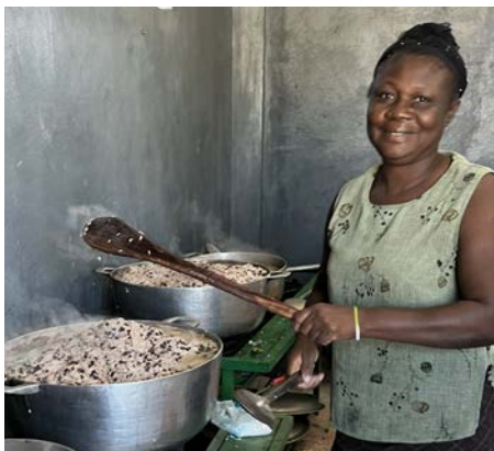
Our cooks work hard to prepare meals for the children.