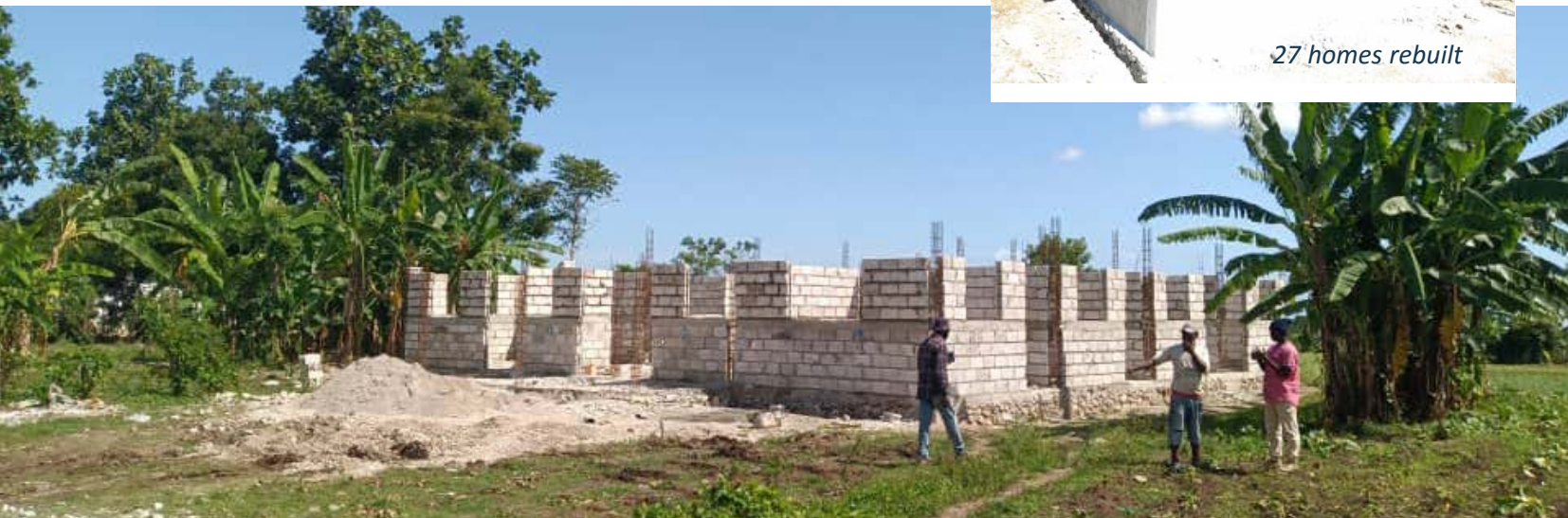
Rebuilding the Camp-Perrin Christian School that completely collapsed during the earthquake