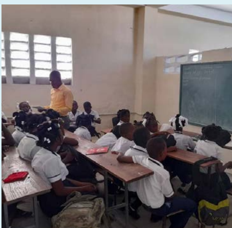
Classrooms at the Cite Soleil Christian School have freshly painted walls and lights!