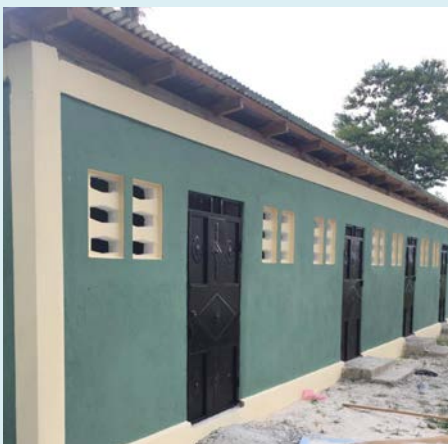
With the addition of four new classrooms in Pageste, this school now has a room for every grade instead of meeting in one open space!