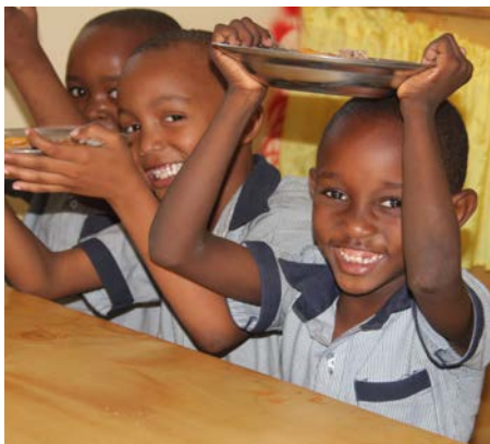
Lunch time brings great joy to our children.

What is the one thing that teachers say impacts a child’s ability to learn? Hunger. While most Haitian children do not have access to consistent, healthy food options, HFHC’s Children’s Food Fund ensures that students in our schools enjoy hot, nutritious lunches.