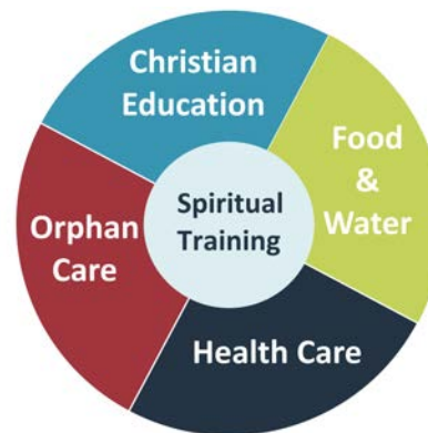
CHILD DEVELOPMENT FRAMEWORK

Consider becoming a Project Hope financial partner. You can see all the specific projects we hope to fund and see our progress toward each effort at the web site www.MillionDollarImpact.org .