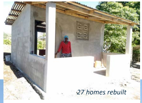
27 homes rebuilt

Last year on August 14, a major 7.2 magnitude earthquake rocked Haiti's southern peninsula, killing 2,189 people. The quake also injured an estimated 12,000 and toppled many homes, schools, and church buildings. Thanks to the outpouring of donations, HFHC has now rebuilt 27 homes in eight communities – causing an outpouring of thanksgiving from these families and the local churches. Also, the Camp-Perrin Christian School, which was completely destroyed by the earthquake, is being rebuilt and is scheduled for completion this summer before school starts next Fall.