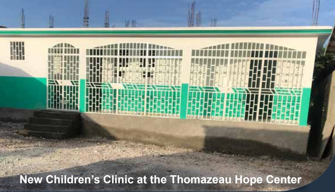
New Children's Clinic at the Thomazeau Hope Center