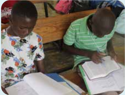
5 youth rallies held in local communities