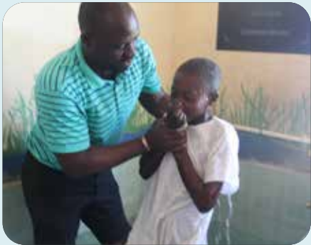
42 baptisms at Camp Hope 2021