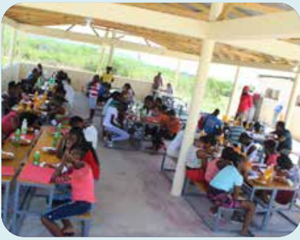
New pavilion for campers