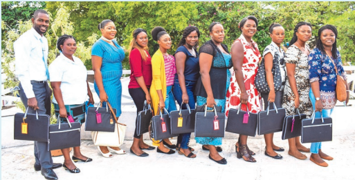
HFHC school nurses gather for training

Hope for Haiti's Children (HFHC) school nurses, based in their local community, are taking a leading role in providing education and health care for our sponsored children. With travel for U.S. medical teams now a near impossibility due to the pandemic and political unrest in Haiti, we are blessed to have ten qualified nurses, hired in the Spring of 2020, to monitor our children's health.