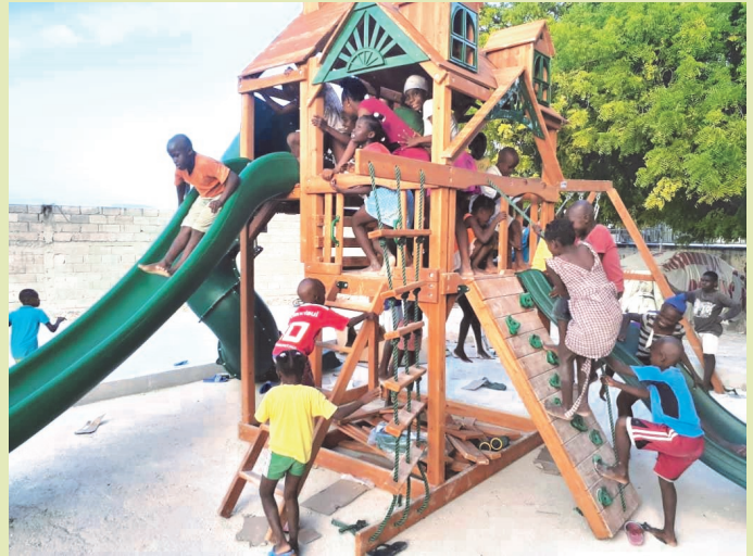
Excitement fills the air as children at the Cazeau Christian Orphanage discover their new playset

This past fall, the children at our Cazeau Christian Orphanage were thrilled to play for the first time on a large playset! Due to unrest in the country, the playset remained in warehouse storage for over a year. After many additional delays due to the pandemic, the Air Force was finally able to deliver the shipment to Haiti. In October of 2020, our Haiti staff recruited a construction crew, including some of the older boys at the orphanage. This team had never assembled a unit like this before, but they successfully worked together to complete the project. Now the children can be heard every day laughing and shouting with joy as they play on the new equipment. What a joyous sight and sound!