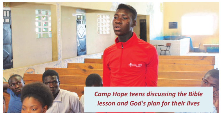
Camp Hope teens discussing the Bible lesson and God's plan for their lives

Camp Hope follow-up efforts are currently underway, with Saturday youth rally sessions scheduled in local Haiti communities throughout the spring. Teens who attended camp last summer will enjoy reconnecting with their friends, sharing a meal, laughing and playing together, and engaging in Biblical teaching and worship. Campers who were selected as student leaders at Camp Hope will have the opportunity to join the leadership team to manage each day's activities and gain experience serving their peers in the spirit of Christ.