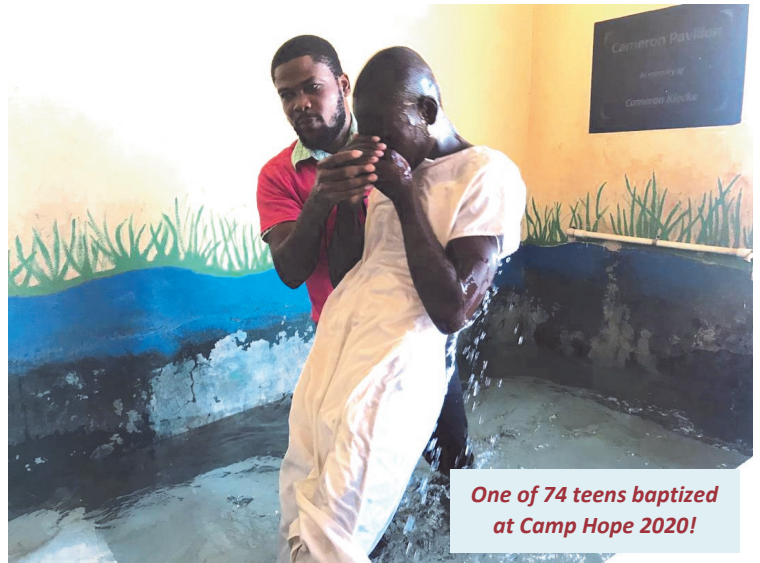
One of 74 teens baptized at Camp Hope 2020!

Camp Hope 2020 engaged a total of 177 teens from ten communities with approximately 50 staff members and resulted in 74 teens giving their lives to the Lord in baptism. The spiritual growth of the campers was accompa-