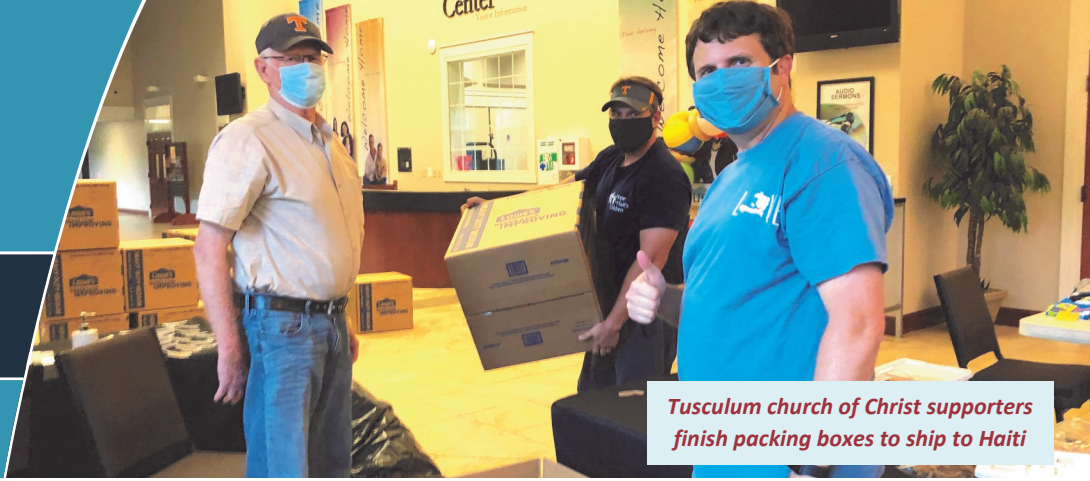
Tusculum church of Christ supporters finish packing boxes to ship to Haiti