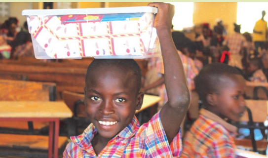
Elated boy at Thomazeau Hope Center steadies his box for the journey home