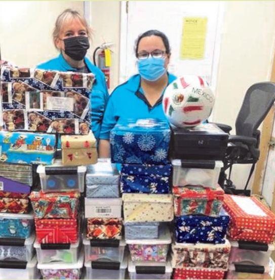
Volunteers at Southeast church of Christ collect joy boxes after services

In addition, Healing Hands Int'l (HHI) in Nashville, TN, helped by providing a large number of filled "Magi Boxes." These gifts ensured that every child in all ten Hope for Haiti's Children schools received a gift box this past December! To HHI and everyone who participated in bringing joy to many children despite a pandemic, thank you!