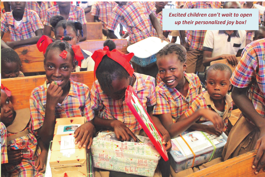
Excited children can't wait to open up their personalized joy box!