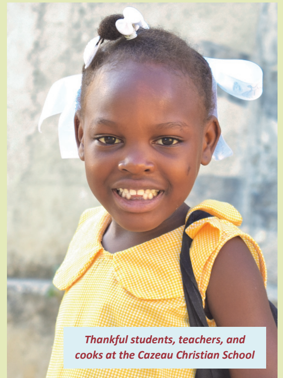
Thankful students, teachers, and cooks at the Cazeau Christian School