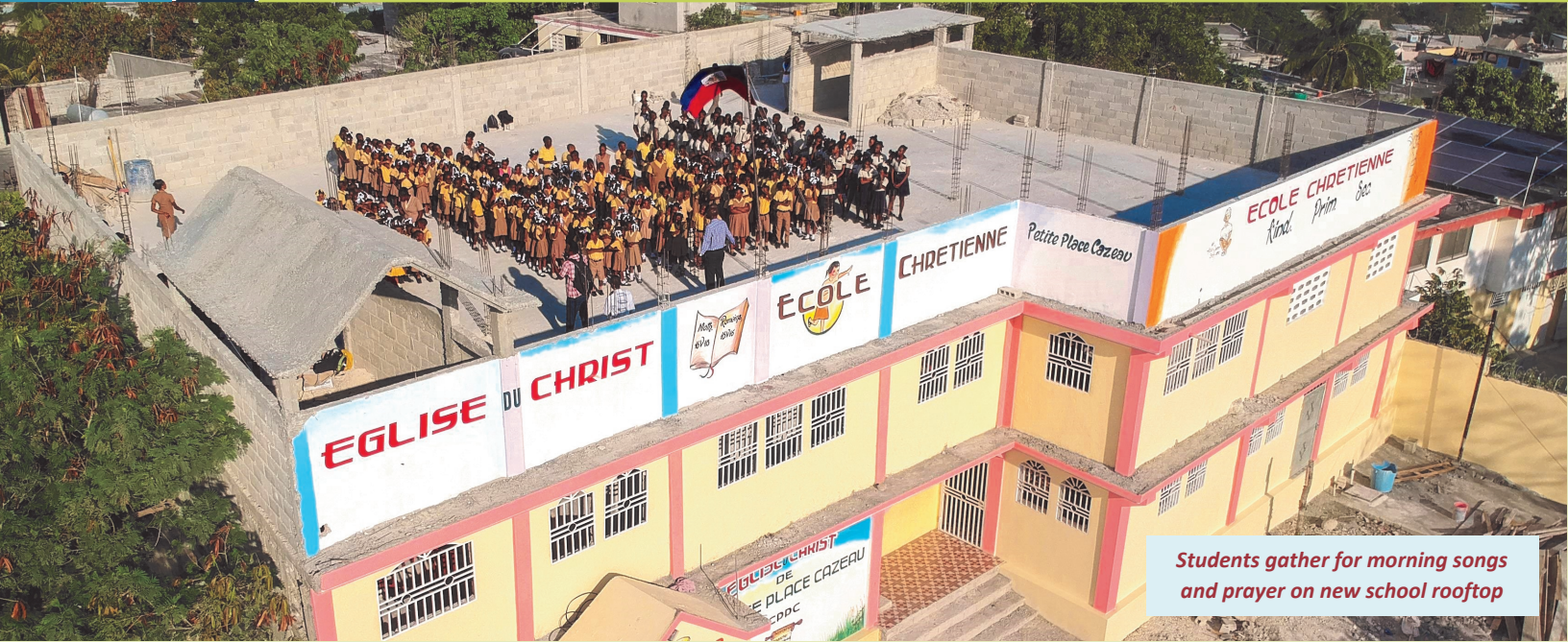
Students gather for morning songs and prayer on new school rooftop

PORT-AU-PRINCE, Jan. 19, 2021 – Students at the Cazeau Christian School were thrilled to meet for the first time on the rooftop of their newly-expanded school facility for thanksgiving songs, prayers, a flag-raising ceremony, and a celebratory band performance! Thanks to Project Hope 2030 donors, this school has tripled in size – now housing a first-floor auditorium (which is also the meeting place of the Cazeau Eglise du Christ), individual classrooms for each grade, a kitchen facility, a school office,