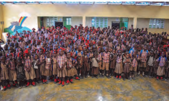
The children of Thomazeau Christian Elementary School who will greatly benefit from the new clinic