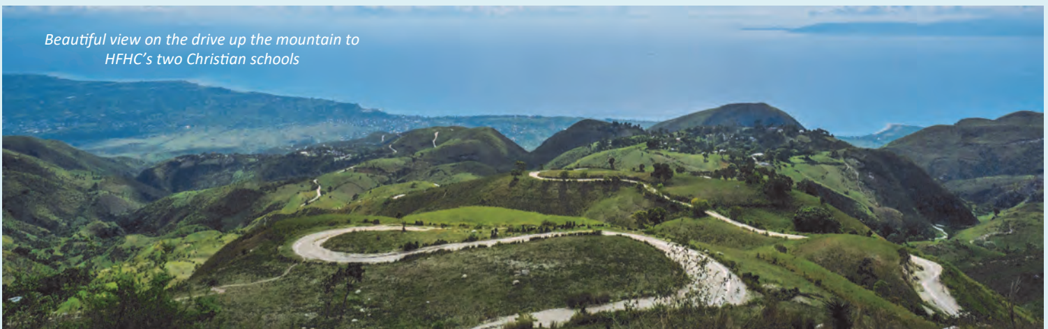
Beautiful view on the drive up the mountain to HFHC's two Christian schools

We visited his school again two days later. It didn't take long to spot him. The improvement was significant, and it