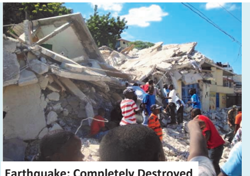
Earthquake: Completely Destroyed