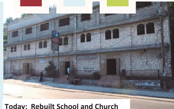
Today: Rebuilt School and Church