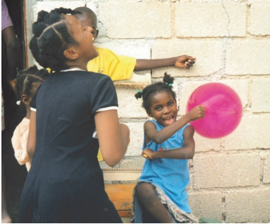
Children playing with balloons inspires first logo