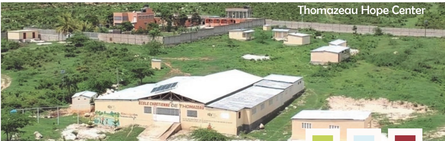
Thomazeau Hope Center