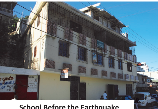
School Before the Earthquake