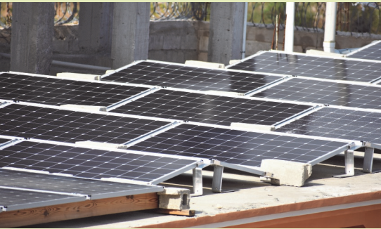
Solar panels are installed on the roof of the new Thomazeau orphanage dormitory

The system currently provides power for three deep-water pumps, two cistern pumps, the orphanage kitchen and dining hall, and the new orphanage dormitory. Solar energy is stored in 24 huge batteries, each weighing over 100 pounds. A small 15-kilowatt Kohler power generator is on standby to turn on automatically during times of peak usage to keep the batteries from fully discharging. Future efforts will transition additional buildings from the old generator system to the new solar system producing significant cost savings.