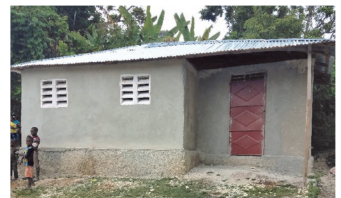
New school kitchen at the Brajirois Christian Elementary School

Thanks to the generosity of many supporters, construction crews have been hard at work all summer to build school kitchens for these two schools. When school began in September, 233 children are now being served a hot nutritious meal each school day for lunch! If you are interested in helping expand HFHC's School Lunch Program, please consider making a donation to the Food Fund.