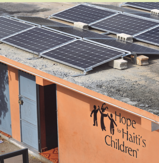
Solar panels providing power for the orphanage dining hall (above); Children of Thomazeau orphanage benefitting from the new power (right)