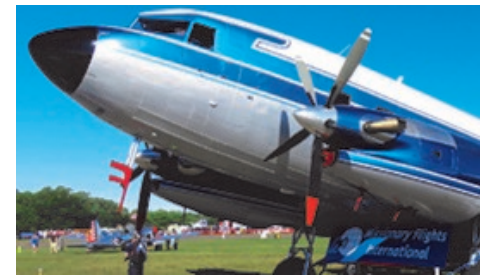
We are grateful for our partnership with Missionary Flights International which transports all boxes into Haiti - making sure they get there in time for Christmas!