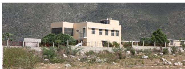
HFHC Hope Center

HFHC/EEH has a 20-acre Hope Center in Thomazeau -- about an hour outside of Port-au-Prince. This is the site of the Thomazeau Christian Orphanage & School. A mission Team Center currently occupies this land with housing for 22. Agricultural development & gardening are a focus for this land as well.