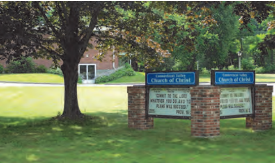
The Connecticut Valley Church of Christ blesses orphans at the Thomazeau Christian Orphanage

This August, construction work started on the new dormitory ("North Dorm") which will provide four large bedrooms and girl bathroom facilities for the 12 children who are currently housed in two 10' x 20' rooms. Completion of this dorm is scheduled for January 2018. Rebuilding Hope 2020 plans include the future construction of a houseparents' quarters and a second orphanage dormitory ("South Dorm") identical to the North Dorm to allow the orphanage to house up to 40 orphaned children.