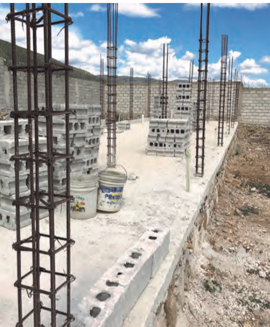
New Dormitory Foundation Work Underway

Thank you. What a tremendous gift to our children.