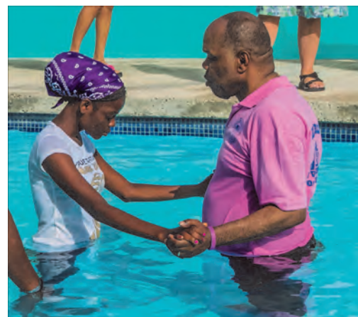
Four young people were baptized at camp