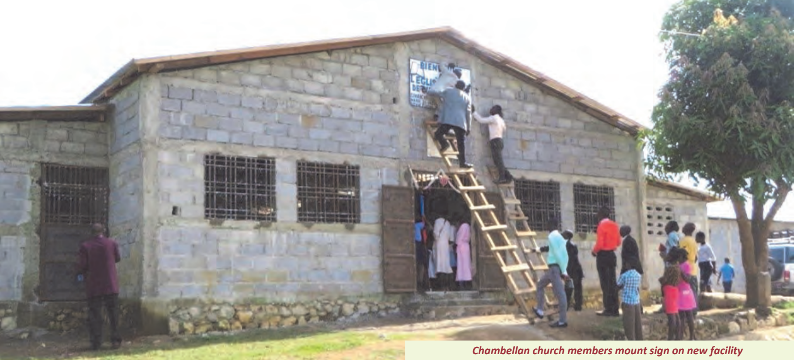
Chambellan church members mount sign on new facility