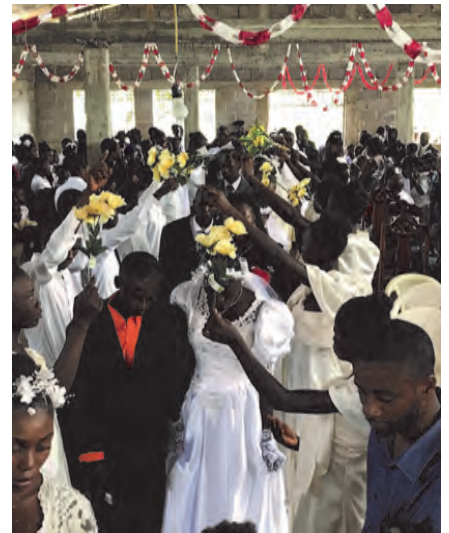
Eight couples arrive to be married in the new facility

Through the generosity of HFHC donors and local Chambellan and Port-au-Prince volunteer construction workers, the church re-opened its doors on Sunday, June 18. What a blessing it was for us to join in the celebration for what God had done for this community!