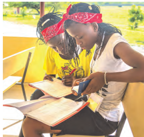
Two teens study the Bible together

Next summer, Camp Hope will host two junior weeks. With help from Rebuilding Hope 2020 partners, HFHC plans to add to the facilities there. The goal for next year's camp is to have both a boys' and girls' shower house, replacing the makeshift "bucket" bath enclosure. By 2020, HFHC hopes to transition the senior week from the Global Outreach rental facility to the Thomazeau Camp Hope facility.