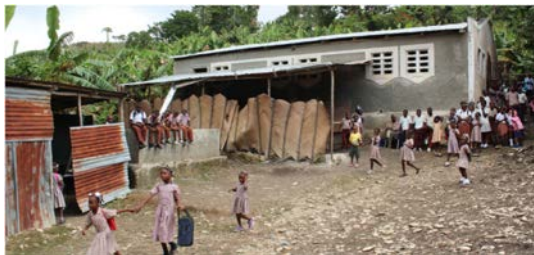
Brajirois Christian Primary School

This remote school is located at the top of a mountain which is a 3-hour drive north of Port-au-Prince, near the western coast. The school building is constructed of concrete block with a metal roof and concrete floor. The facility also serves as the meeting place for the Brajirois church of Christ. An adjacent piece of property was purchased in February 2016 for new school classrooms to be built. Three temporary buildings housing three grades currently are located in front of the main schoolhouse.